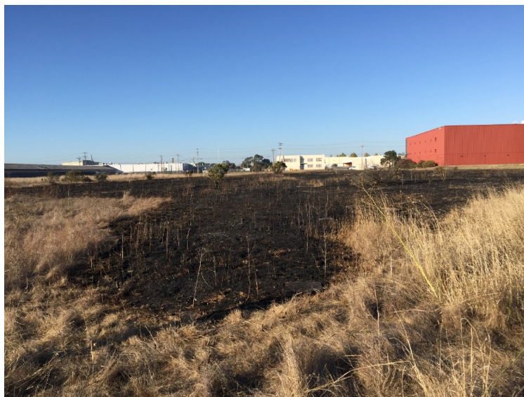
Figure 9.3: Post fire damage from UAS accident at Richmond Field Station, UC Berkeley