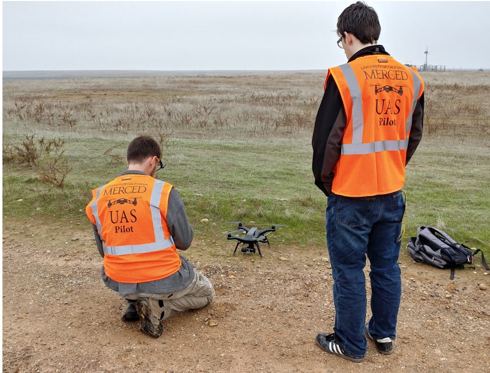
Figure 9.1: UAS operators with high visibility reflective vests