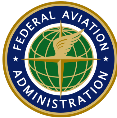
Figure 15.1: Federal Aviation Administration Logo