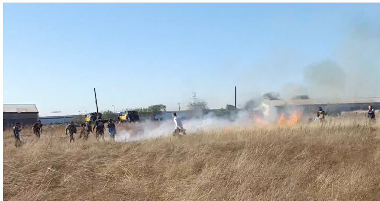
Figure 9.2: Beginning of a fire at Richmond Field Station, UC Berkeley

While UAS accidents and incidents involving fire are rare, they are a valid and significant concern. With the majority of UC UAS usage on field sites and other rural locations, the potential for the accidental sparking of fire is a concern. A fire sparked by a UAS can spread quickly (Figure 9.2) and with California's dry environment, can cause significant damage (Figure 9.3).