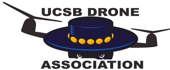
Figure 12.1: UC Santa Barbara Drone Association