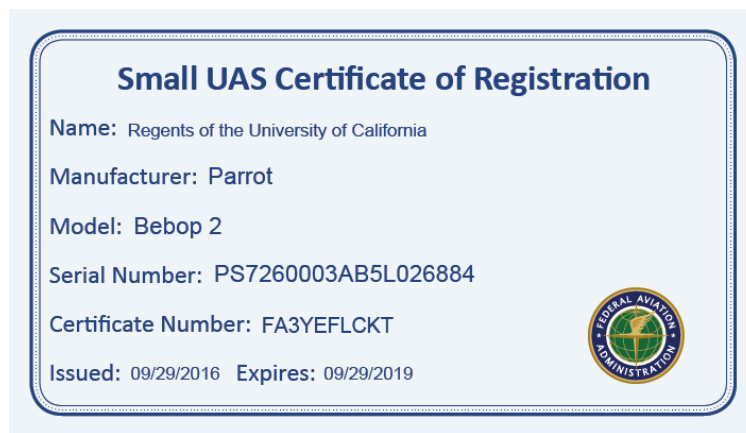
Figure 4.1: Example sUAS Registration Certificate

The Regents of the University of California are the legal owners of all UC property. Similarly to BFB-BUS-19: Registration and Licensing of University-Owned Vehicles, all UC-owned UA must be registered to the Regents of the University of California (Figure 4.1) to meet compliance obligations under 14 CFR 47 or 14 CFR 48.