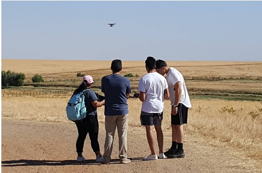
Figure 10.1: Students flying UC-owned UAS for coursework on a University Location.

The Designated Local Authority or location-specific policy or procedure may additionally opt to issue open or standing approval under specific conditions that are deemed to be of low or minor risk on the condition of regular UAS activity reporting.