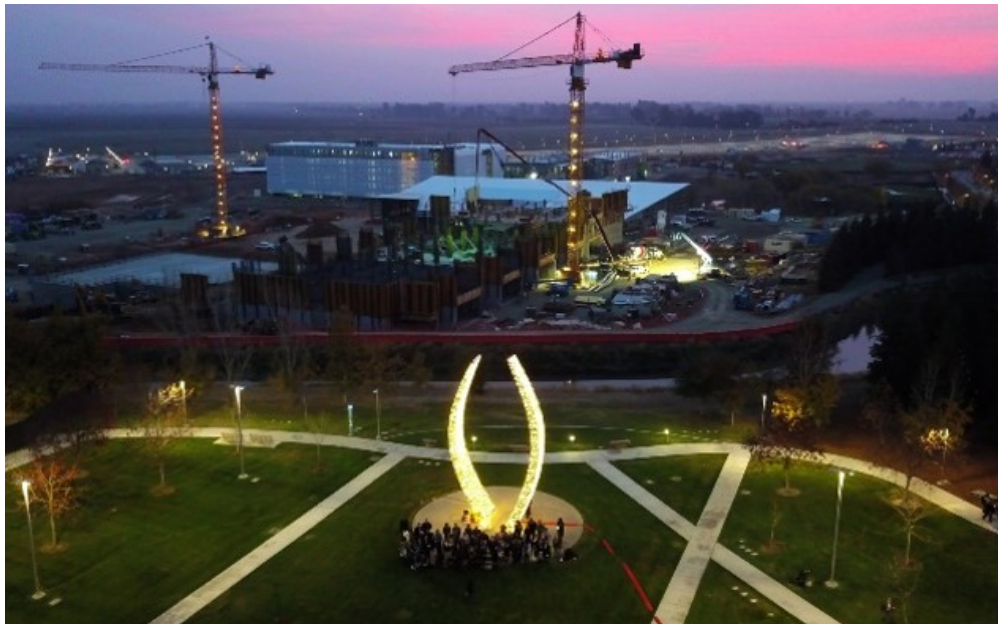
Figure 10.3: Aerial shot of UC Merced at night

After completing the required training, night time operation flight requests are handled in the same process as day time operations. For night time operations on University Locations, notifications may be distributed broadly to avoid unintentional disruptions by campus safety officials or security officers.