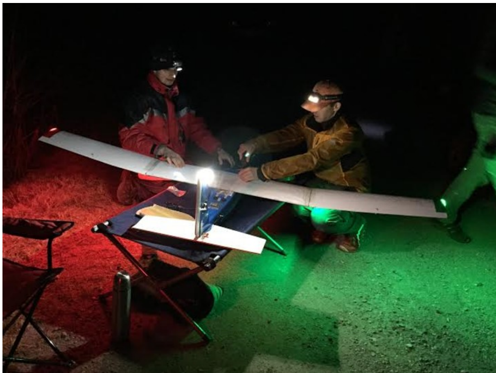
Figure 10.2: Setting up a UAS for night operations - Anti-collision lights on the tail and navigational lights on the wings.

The UC has a systemwide Certificate of Waiver for 14 CFR 107.29 Daylight Operations - Waiver Number: 107W-2018-11555. UC personnel are eligible to utilize the systemwide authorization for University Business, including research and media or publicity use.