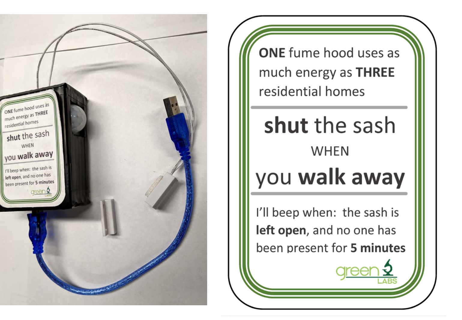
Figure 2: (left) constructed MASH device per MIT Green Labs instructions<sup>2</sup> and (right) UCSD info label.

distinct downward jump in average sash height is visible postinstallation (see Figure 3).