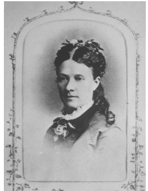
Lucy Wanzer, first UCSF woman medical student, graduation photo 1876.

The principles of gender equality are now firmly etched on the American landscape, and the achievement of full and equal status for women throughout our society now seems more like a historical inevitability than at any time in our past. This does not mean, however, that we do not still have significant work to do, or that change will continue to occur if we do not persevere in our fight for it. By keeping up our work for full gender equity at UCSF, we advance the full equality of women — and people — everywhere.