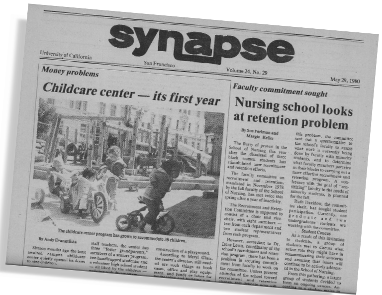
May 29, 1980 Childcare center faced money problems in its first year.

reported having difficulty finding off-hour, infant, and temporary childcare — a barrier that interfered both with work and with student studies. Cost of care was also an issue. The study found that the average cost of childcare across all surveyed UCSF women was $393 per month (approximately six hundred in current dollars) — ranging from a high of $410 per month for faculty to $250 per month for students. At that time, as now, the price of childcare was not affordable for many in need of such services. CACSW used these and other results to support a set of recommendations for future childcare availability at UCSF — a recommendation that had been made earlier in the 1980s, but that now had the weight of study findings behind it.