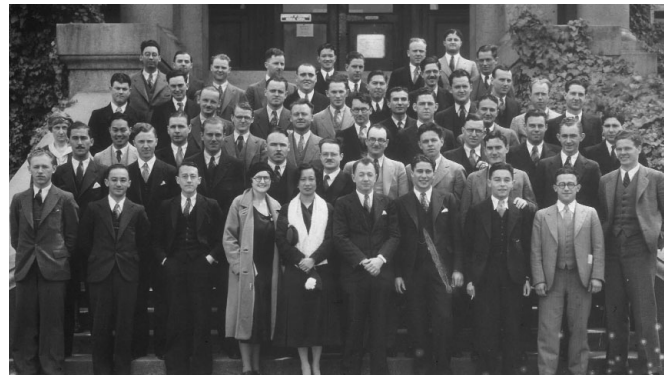
UCSF School of Medicine, Class of 1932.

It is not clear what the reception to the above recommendations may have been at the UCSF administrative level. No documents exist to suggest that any of the recommendations were adopted or followed up by university leadership. Meanwhile, in virtually every respect, the issues above remain largely unresolved at UCSF through the time of this report.