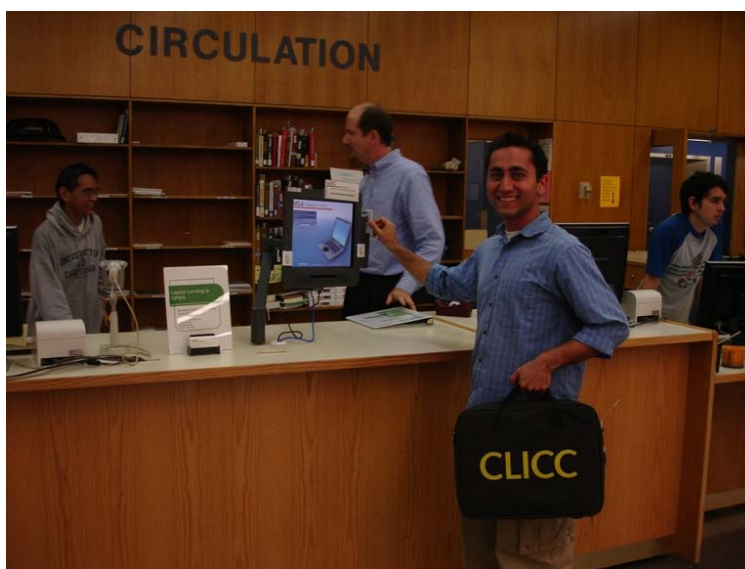
Student using MALCOM to check out a laptop at the Biomedical Library

Finally, the touchscreen kiosk itself is an interesting item for the students. Many enjoy the experience of walking up to it, swiping their card, and using the cheerfully colored touchscreen.