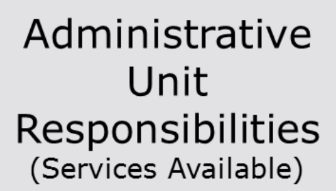
Figure 1: Sample SSDP Financial Model