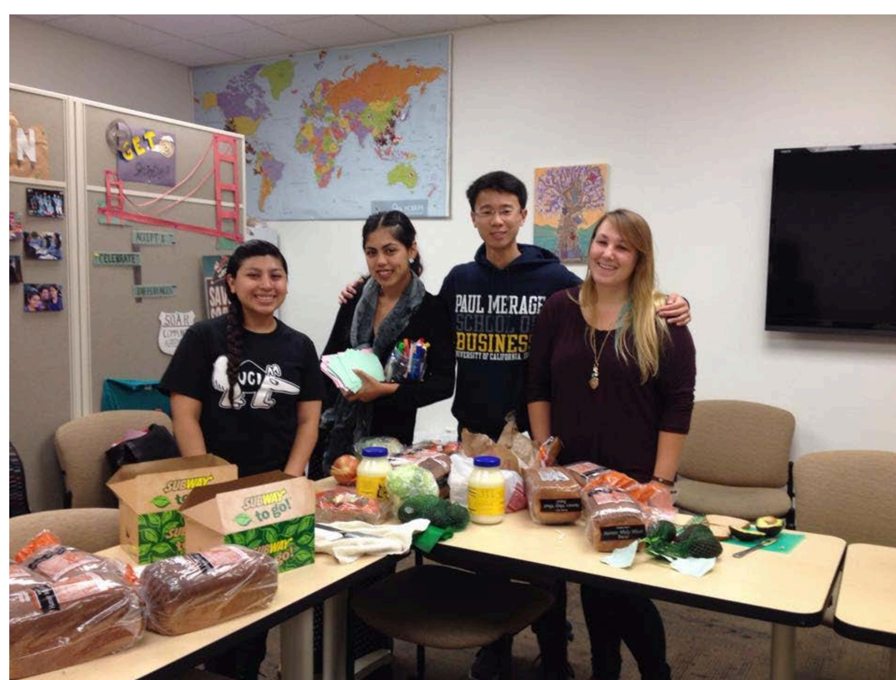
The fellows working with a UC Irvine student to prepare for a program in raising awareness about food insecurity in April 2015.

Food insecurity has been a rising concern for many students at the University of California, Irvine (UC Irvine) in the recent years. Our project focuses on establishing a food pantry at UC Irvine to end food insecurity on campus. In a survey that was conducted by UC Irvine Student Affairs in June 2014, 27% of the 833 participated students reported that they were facing food insecurity issues. Usages and applications for the UC Irvine Campus Food Voucher Program, a welfare program that provides free food vouchers for students to eat on campus, have also been increasing. This initiative was established by the fellows to establish a food pantry on campus and work with UC Irvine administration to provide feasible solutions in combating food insecurity among the students.