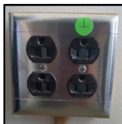
Testing and Labeling for High Quality Ground

The above criteria then allowed the College of Chemistry to develop their own in-house universally adaptable bonding and grounding equipment for all types of storage and receiving flammable liquid containers. In addition, flammable and oxidation gas storage containers could be physically separated and the metal-storage racks and piping distribution systems could all be bonded and grounded to the same building-ground system. All lab-equipment using the flammable gases are now grounded to the building-ground thus electrically-bonding the entire flammable gas distribution system together.