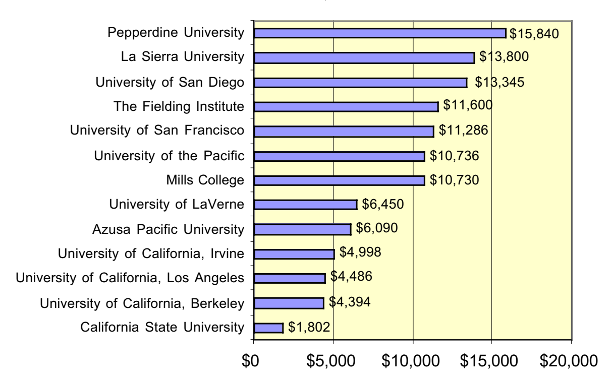
Select Comparison of Graduate Study In-State Tuition and Fees in California, 1997