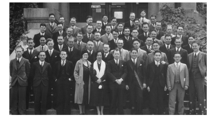
UCSF School of Medicine, Class of 1932.

It is not clear what the reception to the above recommendations may have been at the UCSF administrative level. No documents exist to suggest that any of